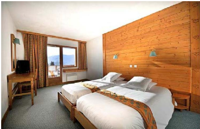
Club Room – Marmotte