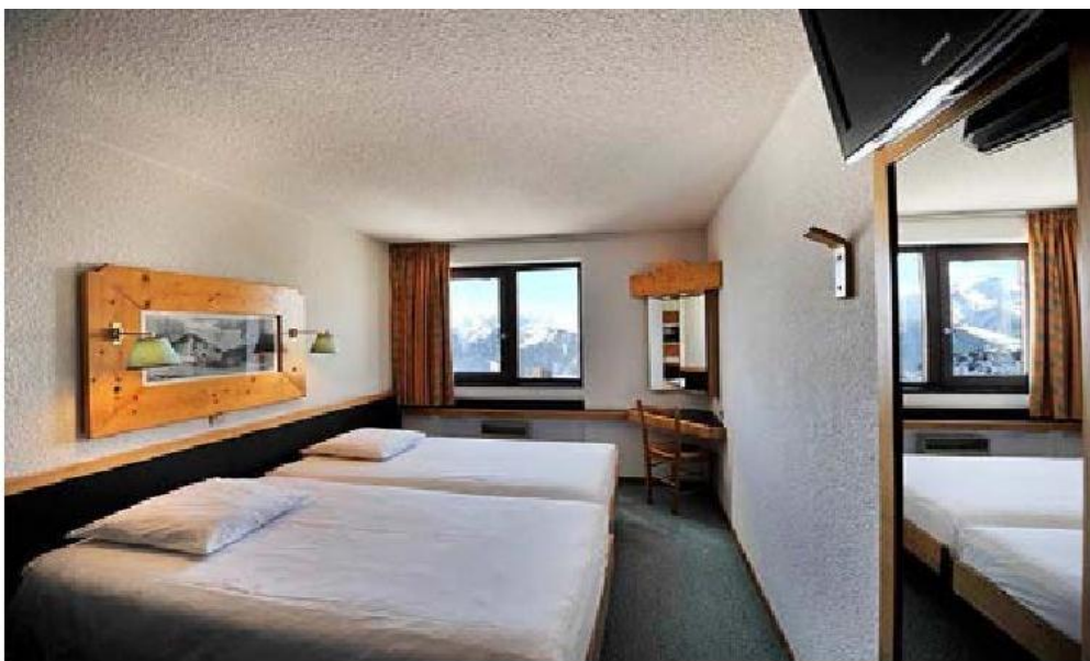
Club Room – South facing