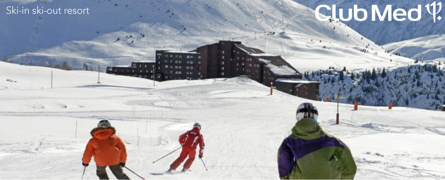
Kids ski lessons