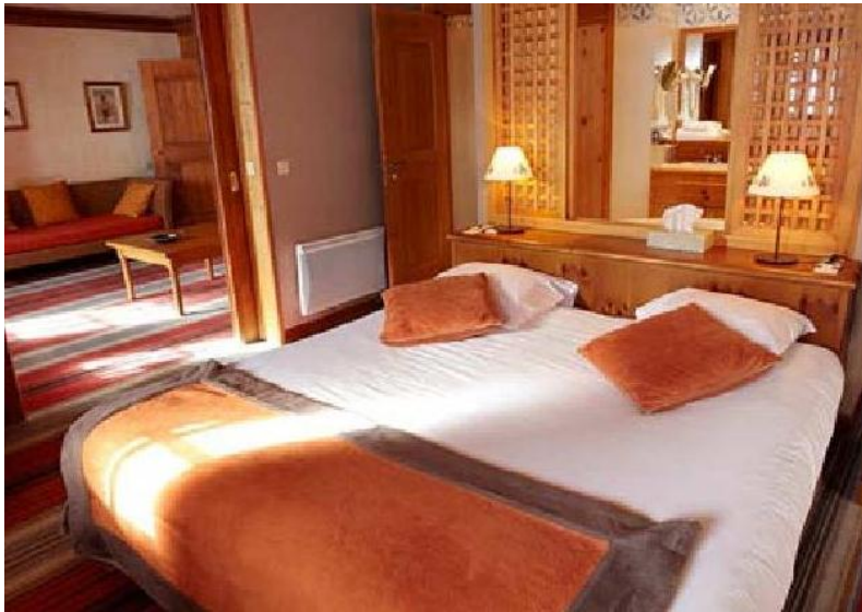
Deluxe Room - Family