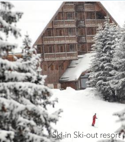
Ski-in Ski-out resort