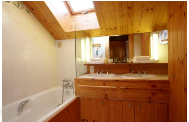
Bathroom - Suite