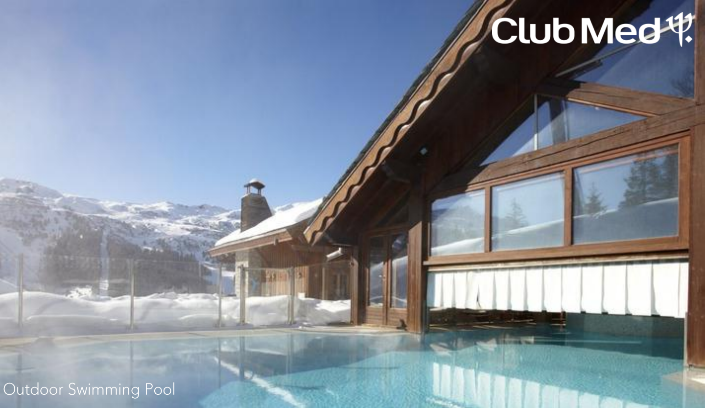
Outdoor Swimming Pool