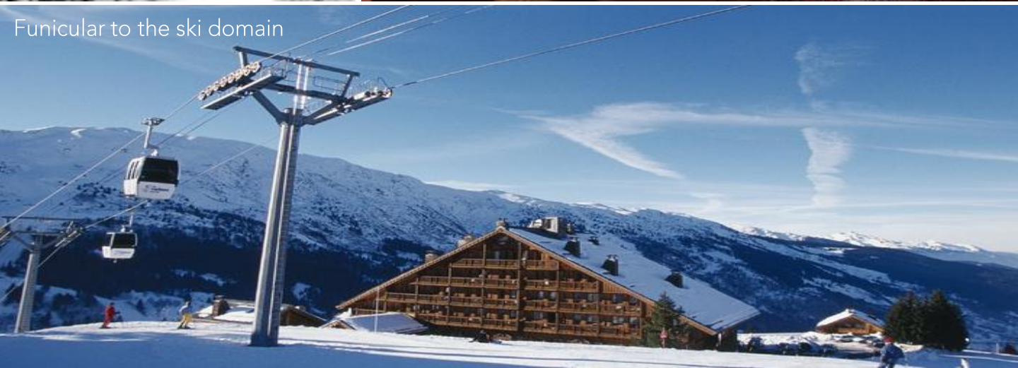
Funicular to the ski domain