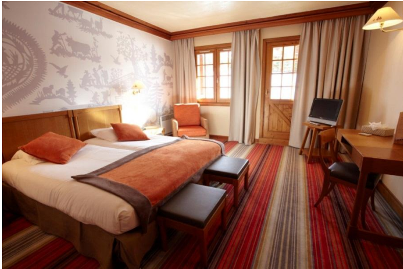
Club Room – Mount Saulire view